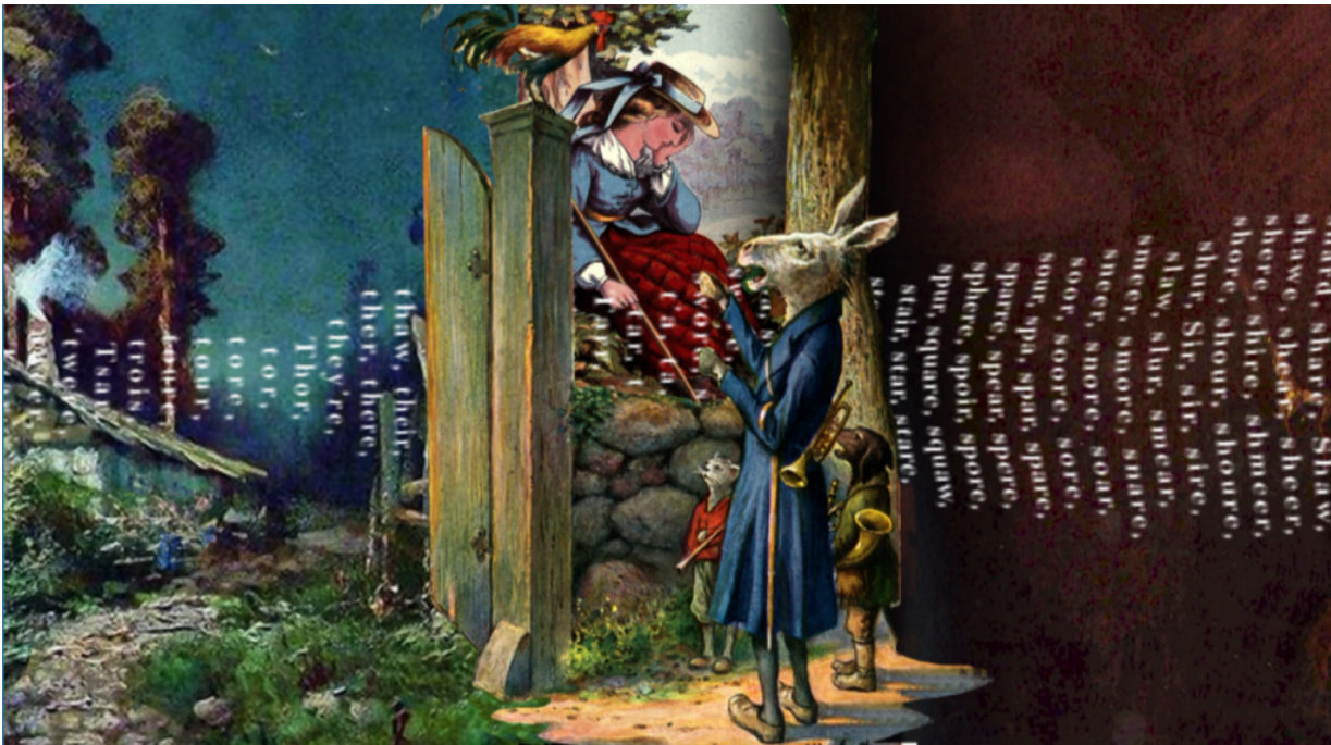
Still from The Golem – An Inanimate Matter (2013)

We Are Not Amused: Who knows where ideas come from? You or me? Or THEM? The Muses are angry and they want their ideas back! This is a story of thieving and reappropriation, staged on a mythological platform.